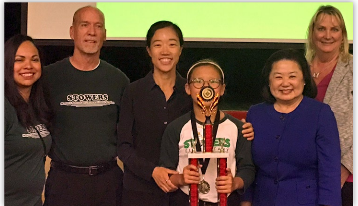
Stowers ES Math Bee Winner