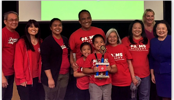
Palms ES Math Bee Winner