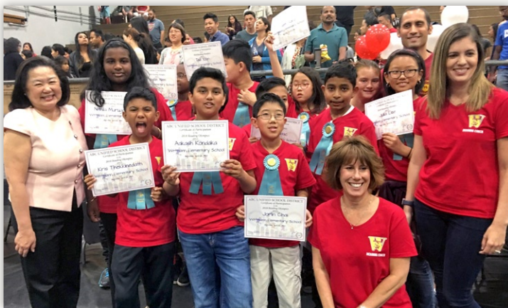
Wittman Elementary School Blue Ribbon Winners