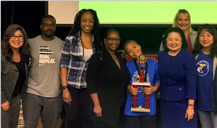
Aloha ES Math Bee Winner