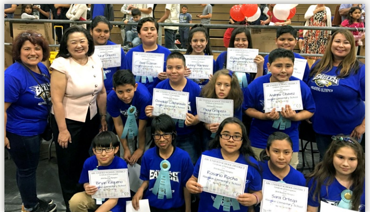
Hawaiian Elementary School Blue Ribbon Winners