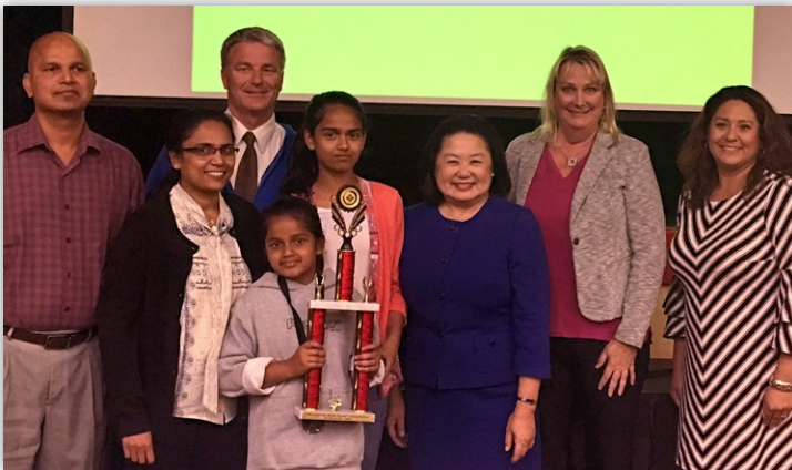
Gonsalves ES Math Bee Winner