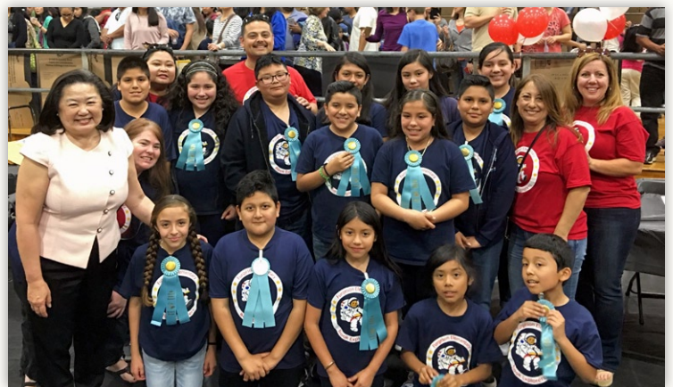
Furgeson Elementary School Blue Ribbon Winners