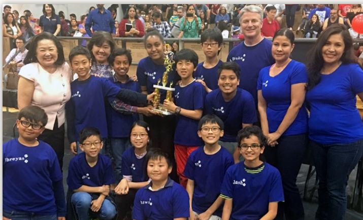
Gonsalves Elementary School 1 st Place Trophy Winner