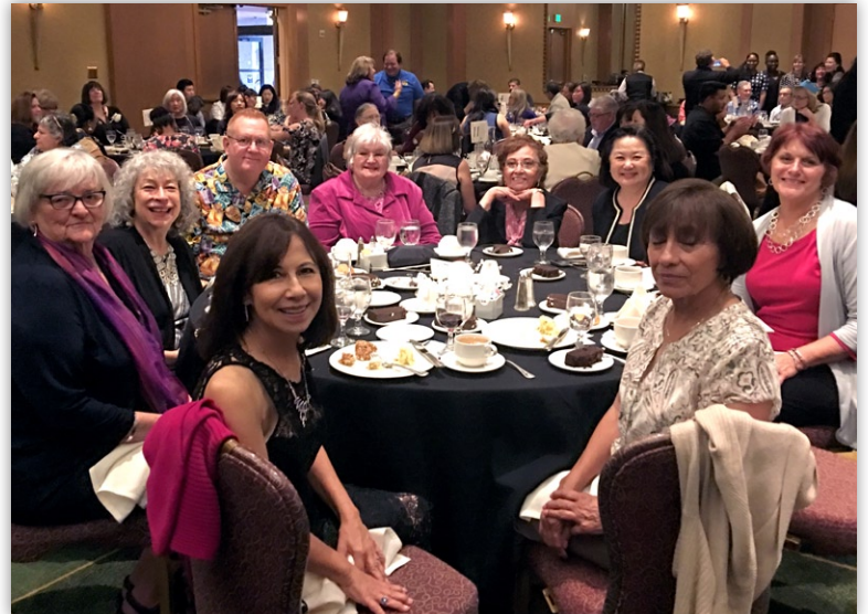
Sponsor - ABCFT Retiree Chapter