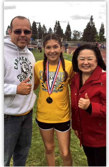
Carmenita MS held on to their 1 st Place title!